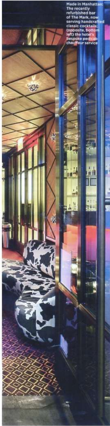
Made in Manhattan: The recently refurbished bar of The Mark, now serving handcrafted classic cocktails, (opposite, bottom left) the hotel's bespoke pedicab chauffeur service